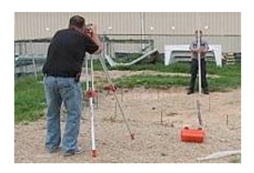
Pool and Wall Layout

Remove the dirt until the ground is level, and free of rocks and/or sharp objects. A transit or laser level is the best tool for this job. These items can be rented at any tool rental store or mass merchant rental department.